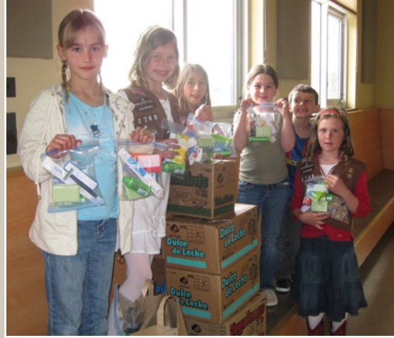
Over $100,000 worth of in-kind donations, including food, blankets, towels, toiletries and other supplies, was generously donated to the Shelter by the community in 2010.

In 2010, the Shelter was an active leader in the development of the Boulder County Human Services Master Plan, which aims to broaden cooperation among area agencies and to minimize any overlaps in services provided.